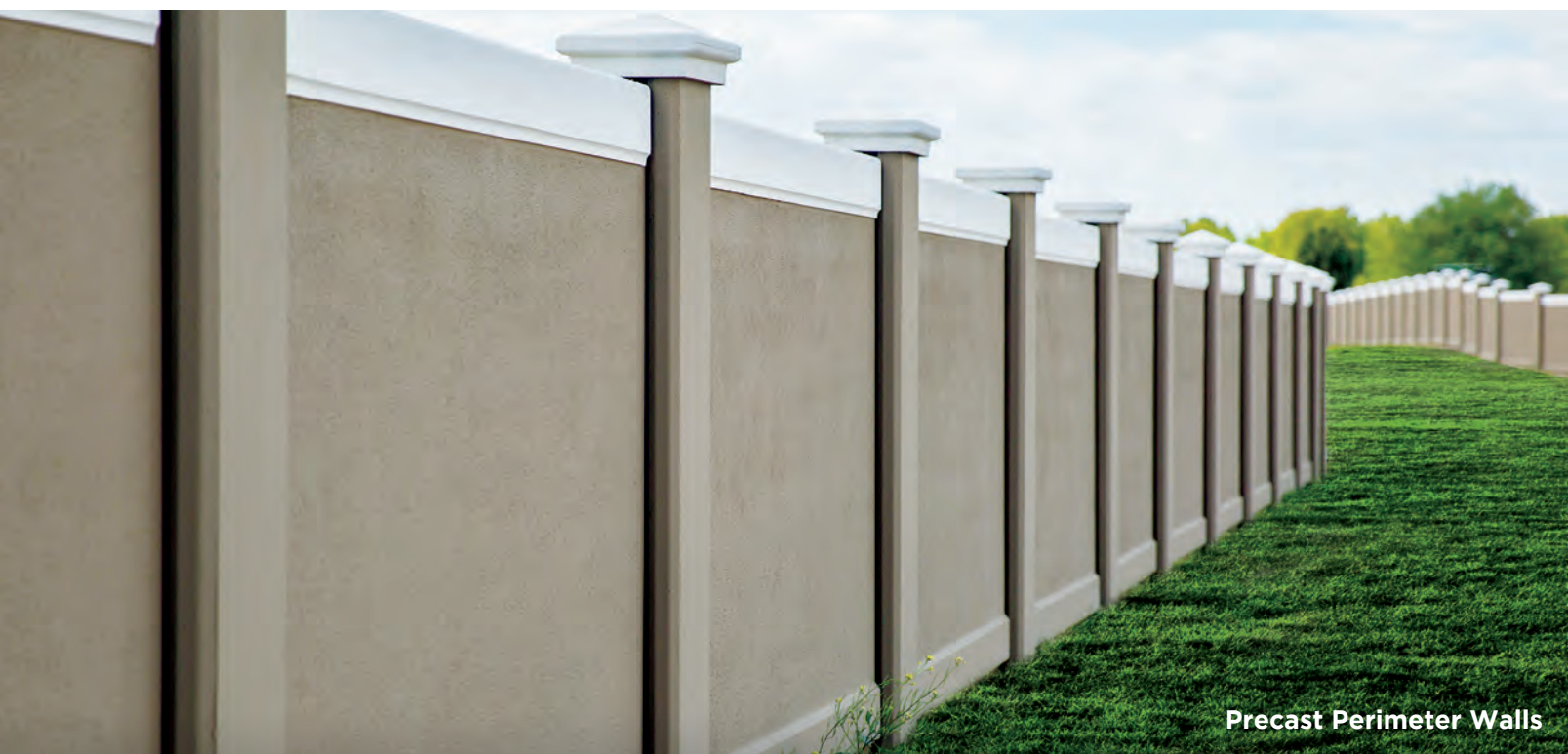
Precast Perimeter Walls