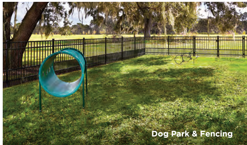
Dog Park & Fencing